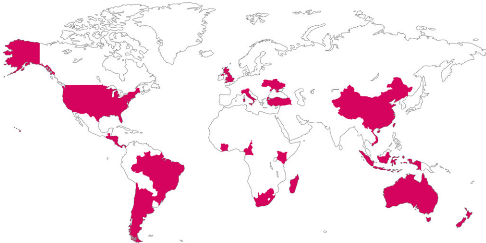
Figure 1. Countries participating in the Global Influenza B Study. April 2014.

The proportion of influenza cases due to type B virus was <20% for 90 seasons, 20–50% for 82 seasons and \geq 50% for 28 seasons; the median percentage was 22.6% (IQR 8.3–37.7%). Figure 2 shows the distribution of seasons according to the proportion of influenza cases caused by type B virus, separately for countries situated in the Northern or Southern Hemisphere or in the intertropical belt. The median proportion of influenza B over all influenza seasons was 17.8% in the Southern Hemisphere (IQR 3.5–30.4%; 39 seasons), 24.3% in the intertropical belt (IQR 10.2–40.8%; 94 seasons), and 21.4% in the Northern Hemisphere (IQR 7.3–38.0%; 67 seasons). The P -value for the comparison of the median proportion of influenza B in the Southern Hemisphere versus the intertropical belt was borderline significant (0.07) and not significant for the other comparisons.