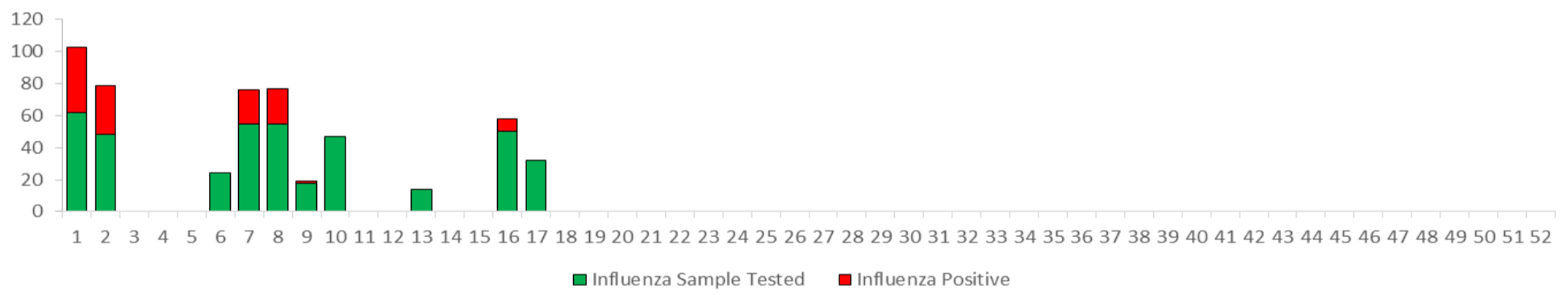
Figure 1: Weekly COVID-19 (SARS-CoV-2) and Influenza (Data for 52 weeks)