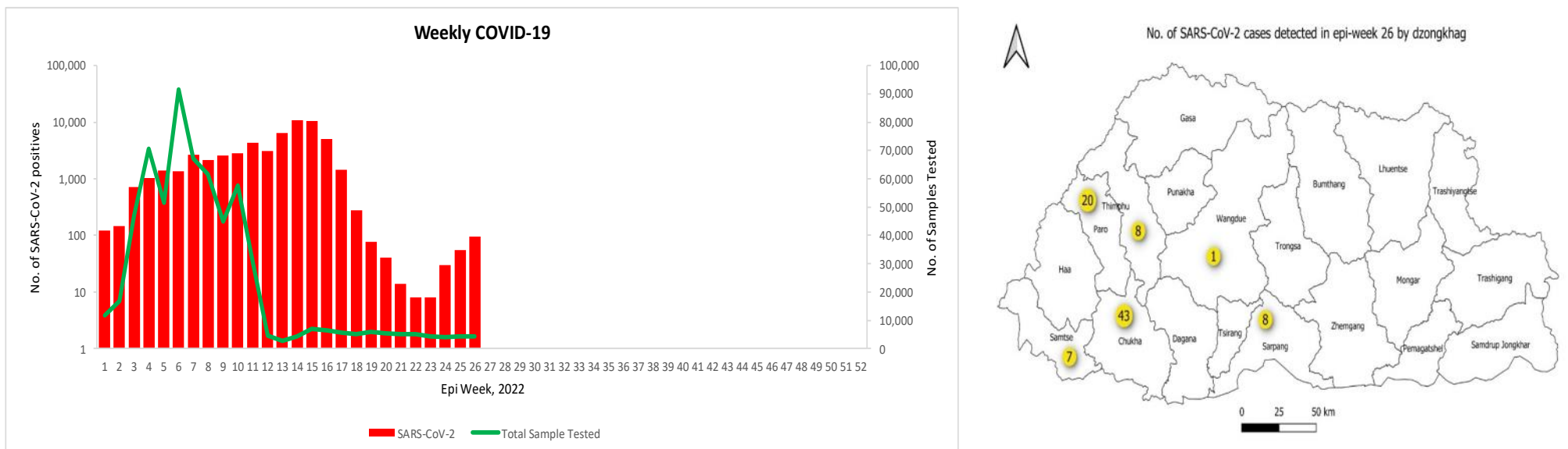
Figure 1: Weekly COVID-19 (SARS-CoV-2) detected from all across the country (Source: Ministry of Health dashboard and RCDC)