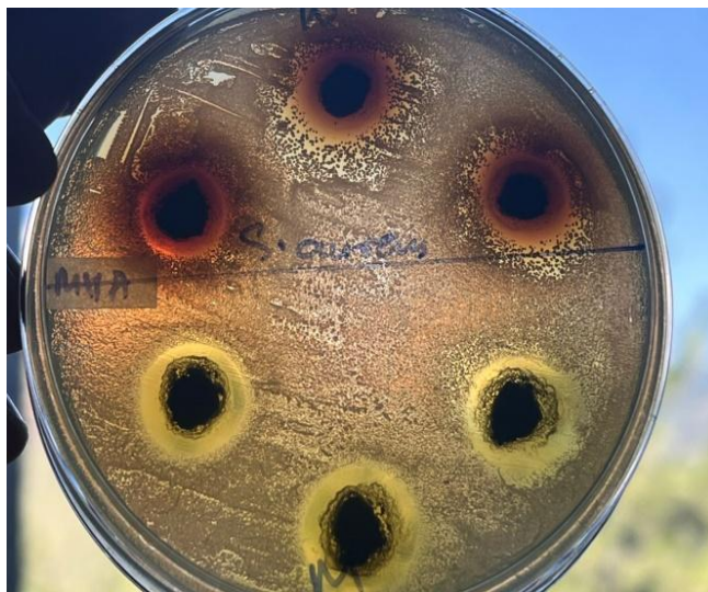
Figure 1: Antimicrobial property of Artemisia extract